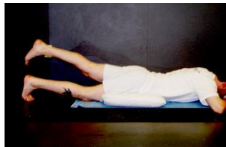
Prone Hip Extension