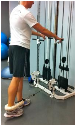
Cable Column Hip Extension