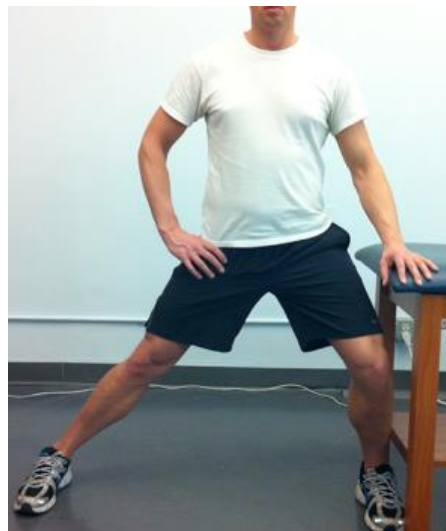
Standing Adductor Stretch