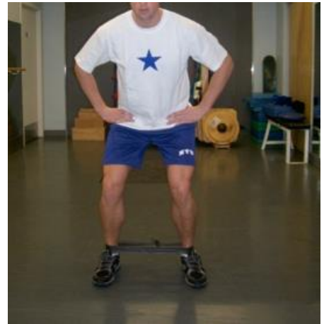
Side Stepping with Theraband