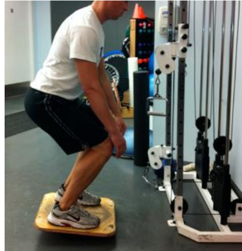
Mini Squats on Balance Board