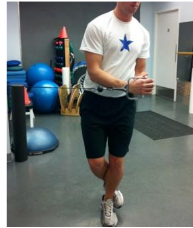
Cable Column Bilateral Rotations → Progress to 1 leg